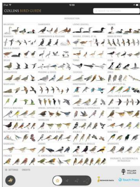
iPad home screen